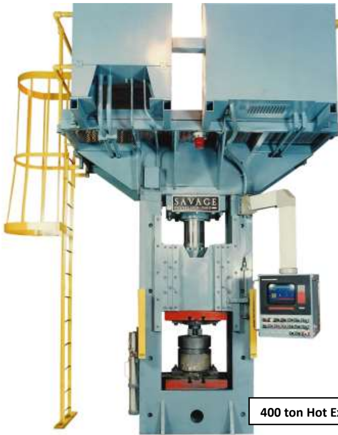
400 ton Hot Extrusion

Tonnage, bed size, stroke, daylight openings, and speeds are all customer-selected to meet your exact specifications