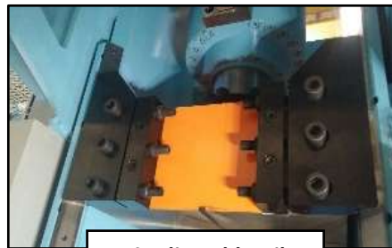
45° Adjustable Gibs