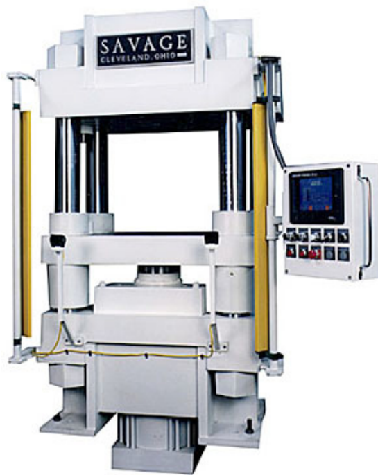
300 Ton 3M Presses are Used to Mold Fresnel Lenses for Overhead View Projectors

Up-acting presses are also used in coining, hobbing, hubbing, embossing and a variety of applications where this action is preferred.