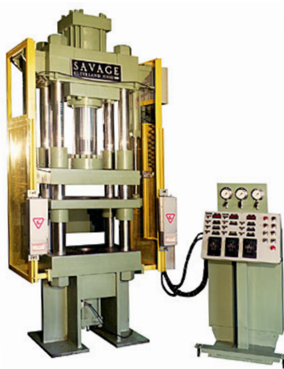
200 Ton 4 Post, Triple Action Draw Press

Triple acting deep draw presses are available in 4 post and straight side construction with different slide configurations. The press shown is a conventional press with the punch holder slide above the blank holder (the punch die passes through a hole in the blankholder) and a hydraulic cushion located in the bed. This press is also available with the blankholder on top and the punch centered within the blank holder as an inner slide. (see drawing inset)