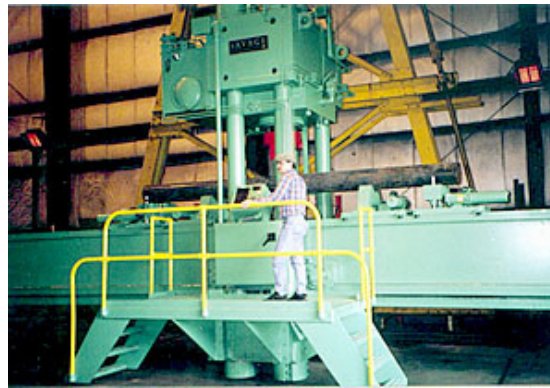
1000 Ton Straightening Press for ocean floor core sampling drill bits