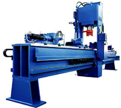
500 Ton bronze bar straightening press