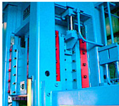
350 Ton Straight Side Press with Prestressed Housing and Long 8-Way Gibs