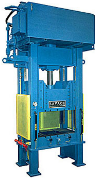
115 Ton Straight-Side Press with 8-Way Gibs

Gibs can be adjusted for a tight running clearance to maintain parallelism even under minor offset loads. Proper running clearance is factory pre-set and rarely needs adjustment. If required, gibbing adjustments can be made front-to-back and side-to-side at all four corners.