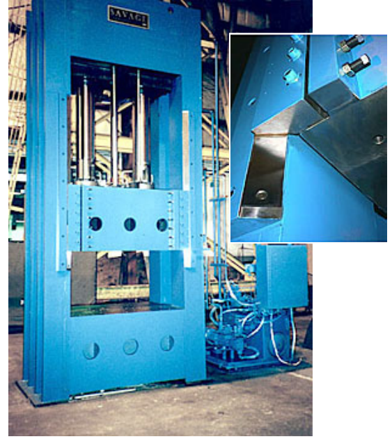
500 Ton Slab-Side Press with Long 4-Way Gibs