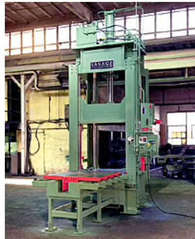
50 Ton 4 Post Spotting Press with Shuttle Bolster