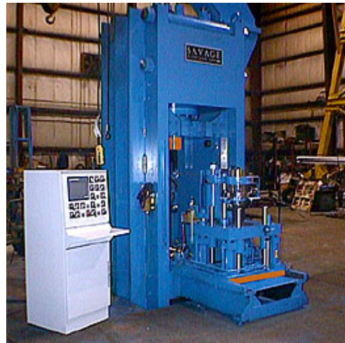
800 Ton Slab Side Compaction Press with Shuttle Table