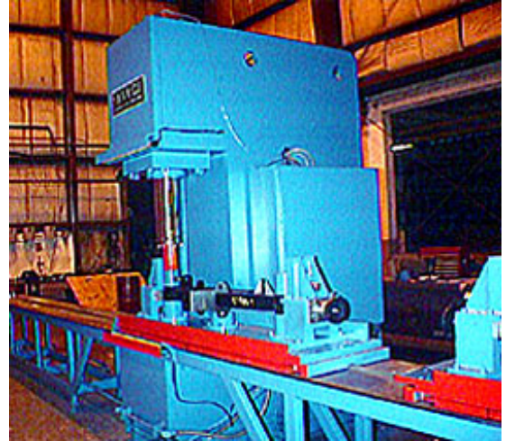
150 Ton C-Frame Assembly Press with 25ft. Shuttle Table at Each Side