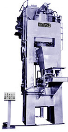
500 Ton Straight Side Briquetting Press

Savage Powder Compaction Presses and Briquetting applications include vertical upacting or downacting compaction for loose fill, bulk materials, and powders. This includes friction materials, metal powders, graphite, carbon, ceramics, boron nitride, carbide, pyrotechnics, explosives, titanium sponge, titanium dioxide, molybdenum, bulk materials, free flowing materials, etc. These presses are available with integral sliding gates, hoppers, ejectors, shuttles, conveyors, and with volumetric or loss-in-weight feeders. Savage compaction presses are designed per application to meet your exact requirements. Three piece powder dies are available with floating or fixed cavity, punches, and stripper.