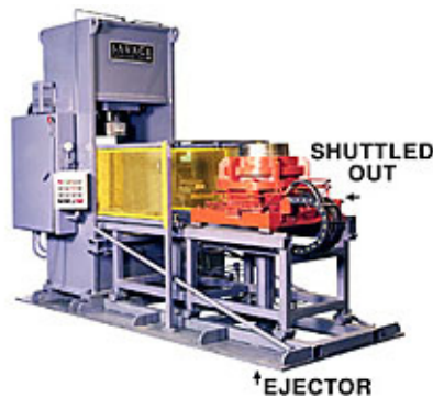
500 Ton Shuttle Table Press - Shuttled Out to Ejection station

Larger size compacts can often be produced in a segmented die which shuttles out and splits open to expose the compact. This eliminates a high tonnage ejector below floor level, since the part can lift out.