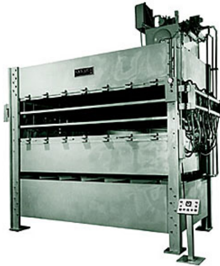
500 Ton Upacting 3 Opening Bonding Press with (4) 168" x 84" Oil Heated Platens for Honeycomb Panels