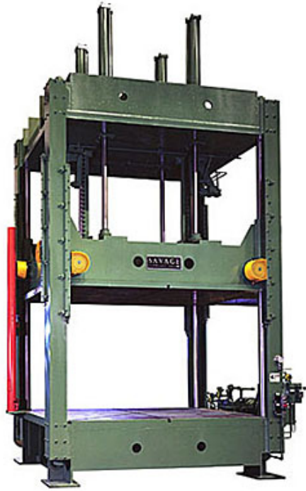
100 Ton Press with 120" x 96" platens and 120" daylight opening. Physical platen blocks allow tool maker to perform repairs in the press.

Illustrating both a basic no frills die spotting press and a die spotter with a shuttle bolster. Both presses have rack and pinion platen leveling or motion controlled leveling to insure parallel contact of dies and molds.