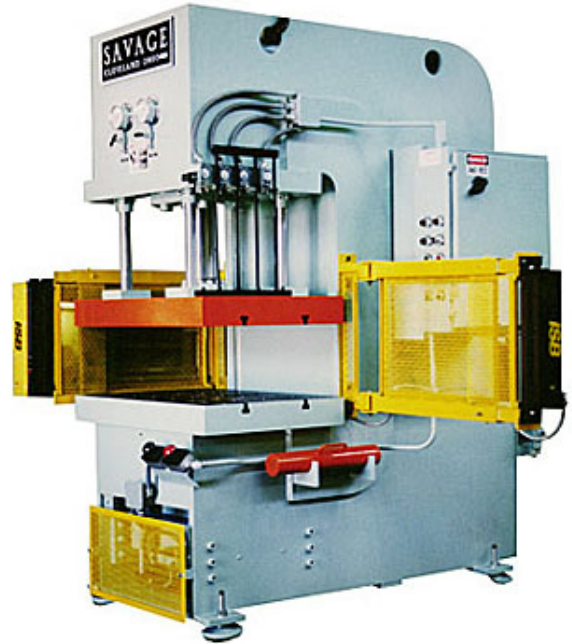
50 Ton Model CFG