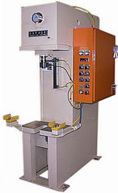
4 Ton C-Frame Press

Savage C-Frame Presses feature a ram adapter with anti-rotation. Savage Guided C-Frame (CFG) Presses are available with 2-post and 4-post guided platens. Gib guided platens are available for the most demanding applications.